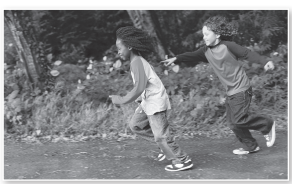
3. They like playing