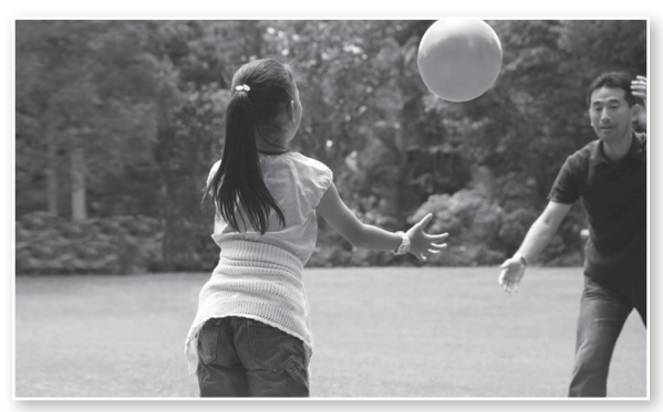
5. They like _____ a ball.