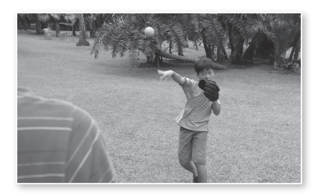
4. I like _____ a ball.